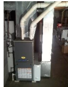
90% or more efficient > (note white PVC pipes)